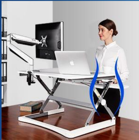
Help Shape Your Body