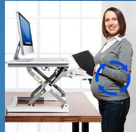
Improve Blood Circulation